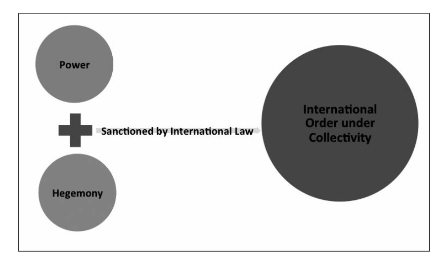
Graphic-3. Machiavelli's International System Configuration<sup>32</sup>

international order, in this way, it can be addressed that Machiavelli attaches power to international law. So, international law is framed by Machiavelli as the best mean to overcome international struggle through its checks and balances. At the micro level, unit of analysis of Machiavelli is the state in an international system in which by the consent of all states to prevent conflict, there is need for international law. Additionally, Machiavelli's understanding of the common good to reach a coherent society to develop the ability to live together in peace is also valid for his configuration of the international order that is sanctioned by international law.