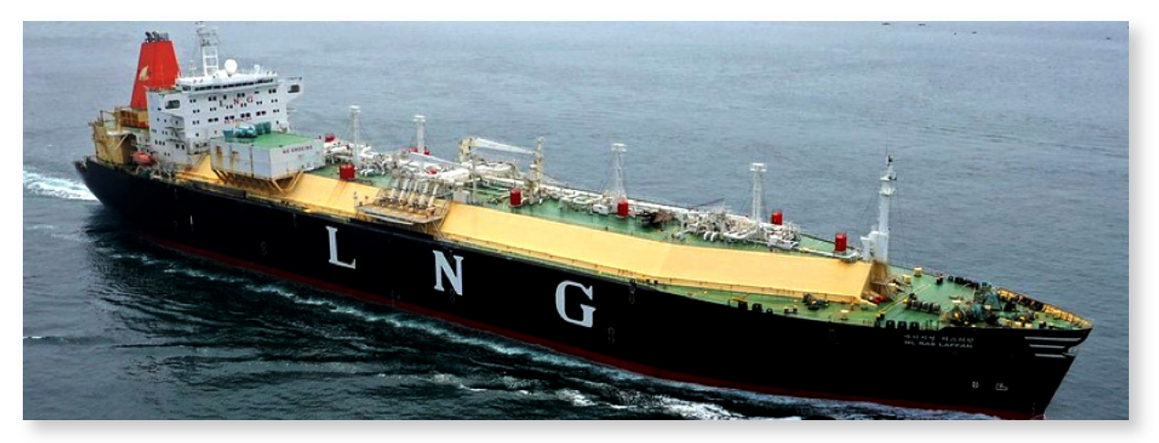
LNG tanker departing Ras Laffan Refinery in Qatar