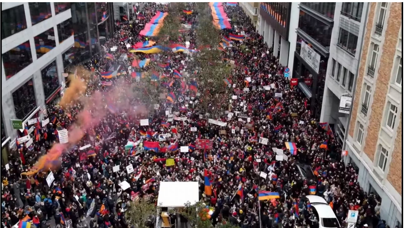
Armenian groups holding a demonstration in Brussels to draw attention to their views on the clashes between Azerbaijan and Armenia over the Nagorno-Karabakh conflict