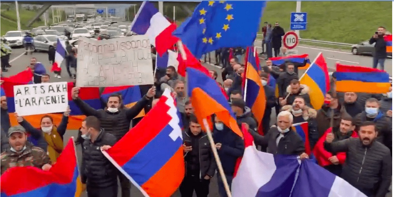
Armenian protestors block a Belgian motorway to draw attention to their views on the clashes between Azerbaijan and Armenia over the Nagorno-Karabakh conflict