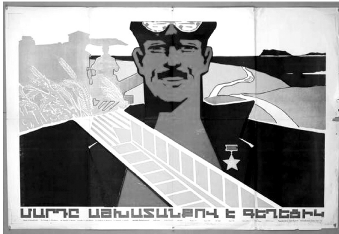
Poster 3 38 : The Propaganda Poster on Employment 39