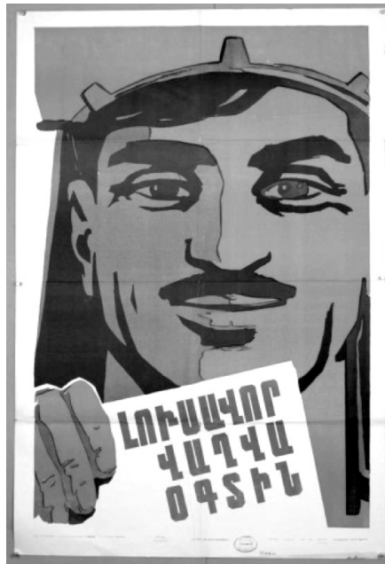
Poster 2 36 : The Propaganda Poster Future 37

The future propaganda poster was prepared by Rafael Pogosi Nanushyan in 1955. Considering the expressiveness function, it is seen that there is a visual of a man smiling and holding a paper in the poster. The person in the poster is depicted as wearing a kind of hat.