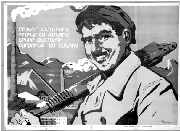
Poster 6 44 : The Propaganda Poster on Soil 45

The propaganda poster on soil was created by Khachatur Hovhannesi Gyulamiryan in 1959. Considering the expressiveness function, the poster depicts a man holding a work tool with a proud attitude. The perception that the male is a mine worker is inferred through the visual codes in the poster. As in the other posters, it is seen that the man in this poster is smiling.