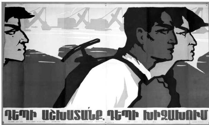
Poster 4 40 : The Propaganda Poster on Courage 41

The propaganda poster on courage was prepared by Aram Borisovich Zakaryan in 1958. Considering the expression function dimension, it is seen that there are three visuals of men moving in one direction in the poster. One of the men in the poster is depicted with a bag on his back and a hammer-like tool inside the bag. When examined through visual codes, it is seen that men have a determined facial expression. On the background of the poster, there are indicators that create a perception that the place where the men are located is a mine.