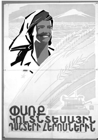
Poster 7 46 : The Propaganda Poster on Collective Farm 47

The propaganda poster on the Collective Farm was prepared in 1970. There is no information about the artist of the poster. When examined in terms of expressiveness function, it is seen that wheat ears are positioned in the centre of the poster. There is an image of a smiling woman in overalls on the wheat with a star-shaped medal on her left chest. Under the wheat are images of a harvester and a truck. There is a mountain image on the background of the poster.