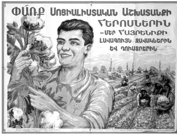
Poster 1 34 : The Propaganda Poster on Heroism 35

ՄՍՌ Մինիստրների սովետին կից Կուլտուր-լուսավորական հիմնարկների գործերի կոմիտե) within the Armenian SSR Council of Ministers. When examined in terms of expressiveness function, it is seen that there are workers working in the cotton field in the poster. In the centre of the poster, there is an image of a man picking cotton. Visual codes reflect that the male holds the cotton seedling and smiles. It can be seen that there is also a medal on the left side of the man's chest.