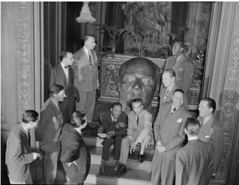
African American leaders and musicians pose before the bust of Atatürk at the Turkish Embassy, the 1950s

The United States Senate warned the Turkish Embassy not to permit African Americans to attend Embassy social events. The US Department of State offered a "compromise" that Black Americans be admitted from the back door of the Embassy. Turkish Ambassador Munir Ertegun responded that all guests of the Turkish Republic would enter through the front door as equals. Maryland police arrested the Ambassador's son, Ahmet Ertegun, for violating segregation laws in Annapolis. Ahmet Ertegun eventually founded Atlantic Records, where he promoted countless African American and progressive musicians.