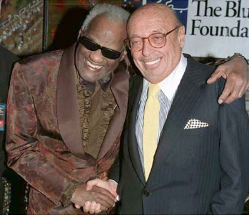
Atlantic Records Chairman Ahmet Ertegun and Ray Charles