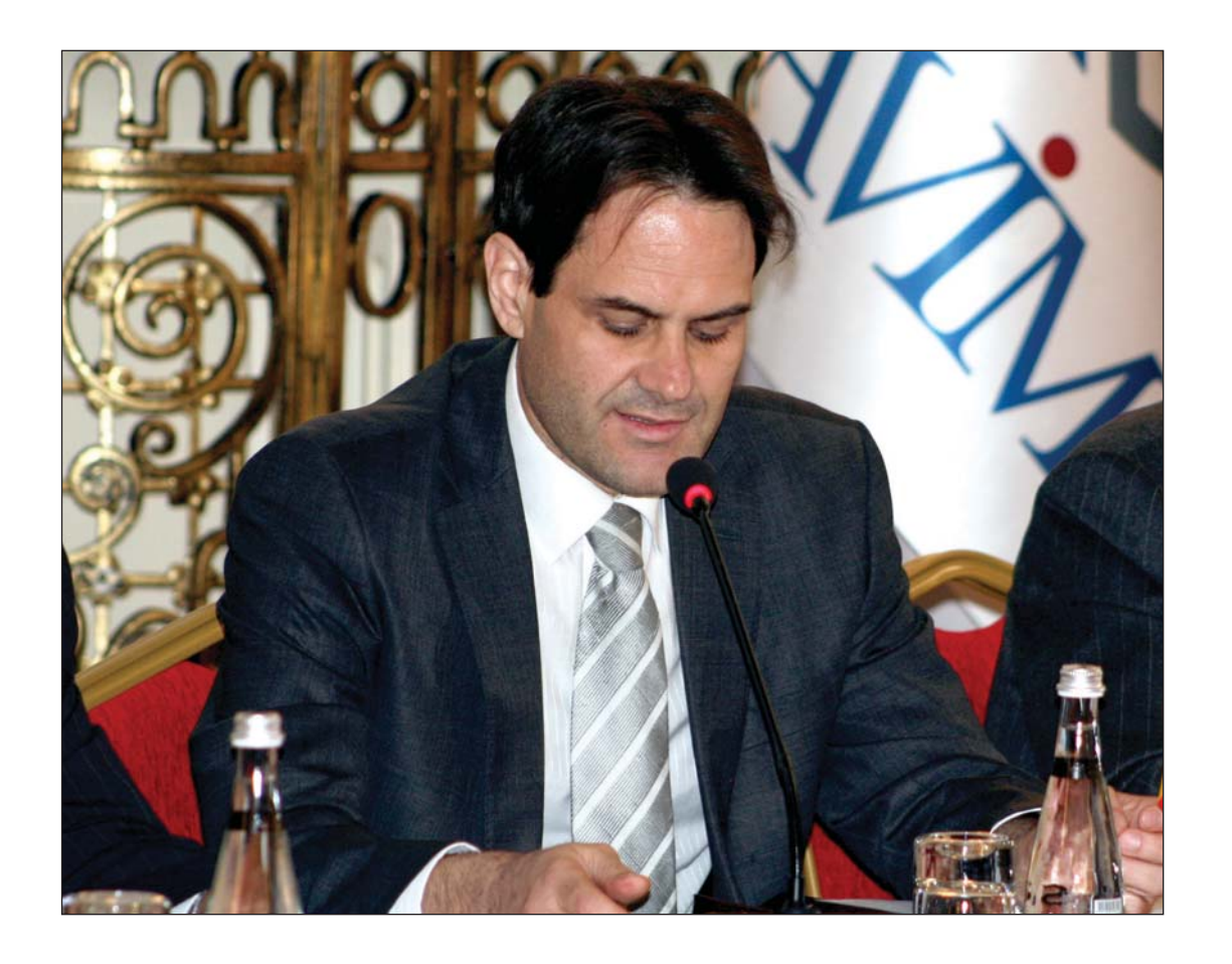
H.E. Goran TASKOVSKI Ambassador of Macedonia

<u>ECONOMY IN THE REGION</u> – economic prosperity and stability as a measure for political and ethnic cohesion, cooperation and understanding