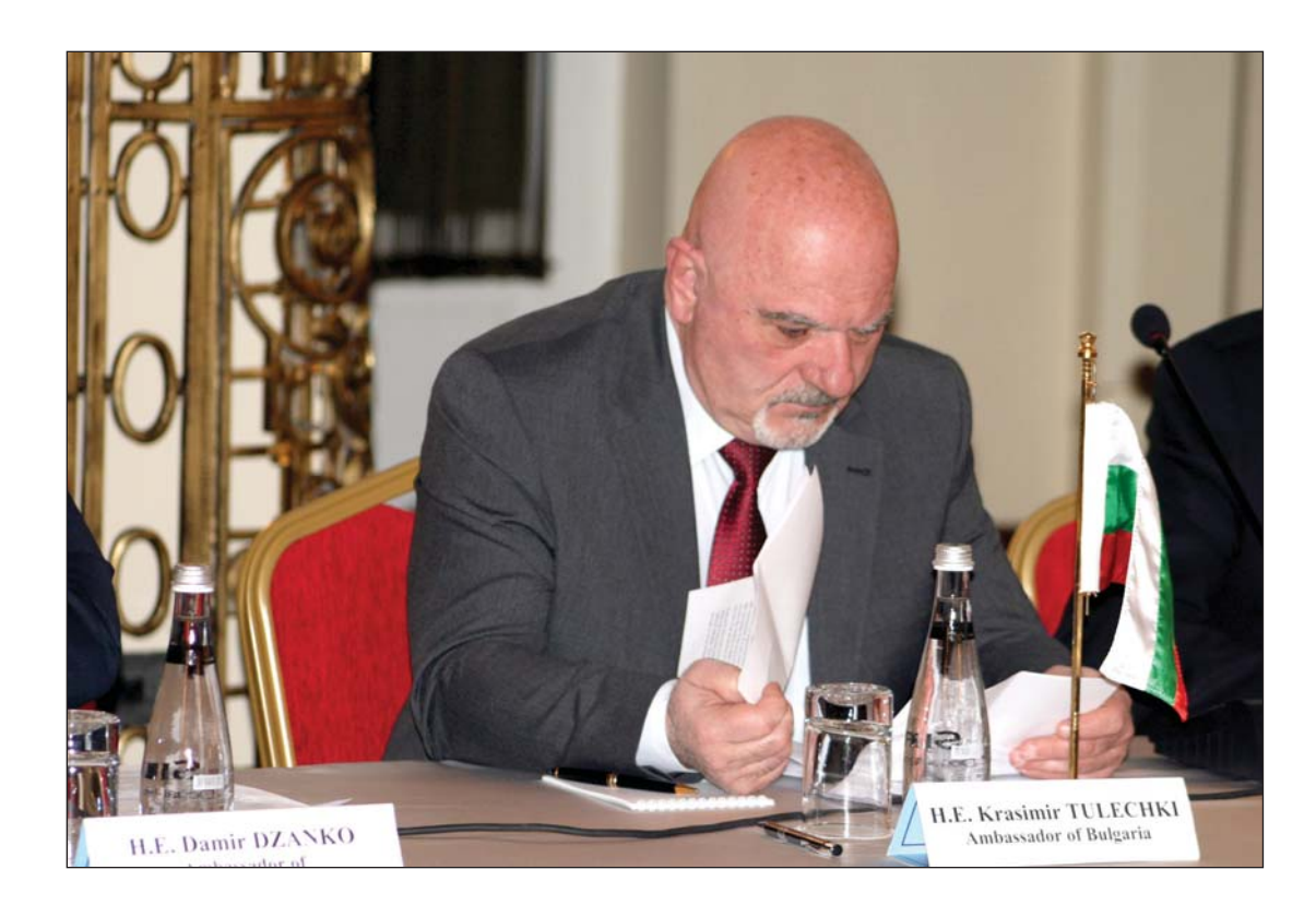
H.E. Krasimir TULECHKI Ambassador of Bulgaria