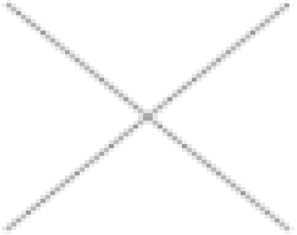
Table 1 □ Two sample signatures that are attributed to Mustafa Abdulhalik Bey in the Naim-Andonian Documents and two original signatures from the letters in the Ottoman Archives

In Table 1, sample number 1 and 2 are the signatures from Naim-Andonian documents attributed to Mustafa Abdulhalik Bey. Throughout the book, all the signatures attributed to Mustafa Abdulhalik Bey are exactly the same as these two fake signatures. However, taking into account Mustafa Abdulhalik Beys genuine signatures in sample number 3 and 4 that are taken from two letters dated 21 December 1915 and 7 February 1916 in the Ottoman Archive, it will clearly be seen that the signatures in the Naim-Andonian documents are undoubtedly fake. Therefore, it is revealed that Andonians most basic claim to prove the documents are authentic is in fact baseless and that the documents are indeed fake. Akçam again brushes aside this issue and provides no explanation for it.