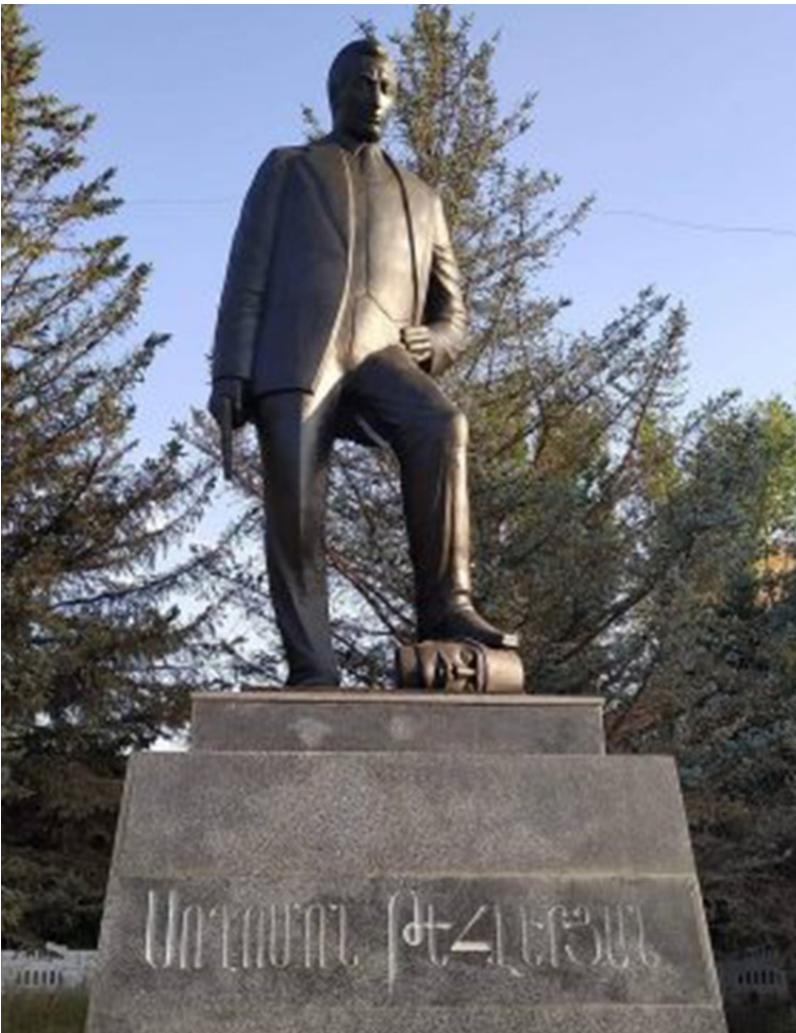
The photo of the Soghomon Tehlirian statue in Armenia-Maralik shared by Turkish media