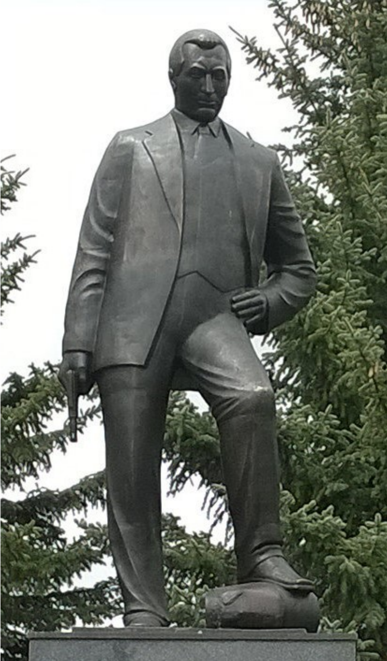
The Soghomon Tehlirian statue in Armenia-Maralik during its unveiling