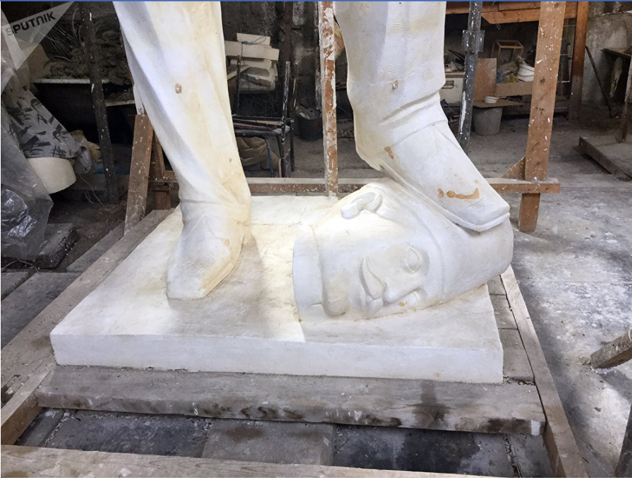
The Soghomon Tehlirian statue in Armenia-Maralik during its design stage