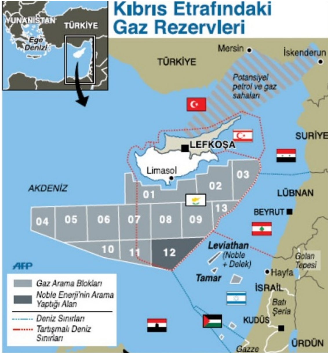
Natural Gas Reserve Areas in Eastern Mediterranean (Karaçin,2012:10-11)

Cypriot Administration) are conducting oil and natural gas research in this area. In 2007, the Greek Cypriot Administration separated its self-declared exclusive economic zone into 12 sectors and granted permission to the companies American Noble, Italian ENI and French Total to do research. These decisions of the Greek Cypriot Administration, which positions itself as the sole representative of the island, are contradictory to the current status. It has made agreements with Egypt and Israel in the field of energy, despite the fact that it does not have unilateral power to make decisions regarding the islands administration and to make international agreements.[3]