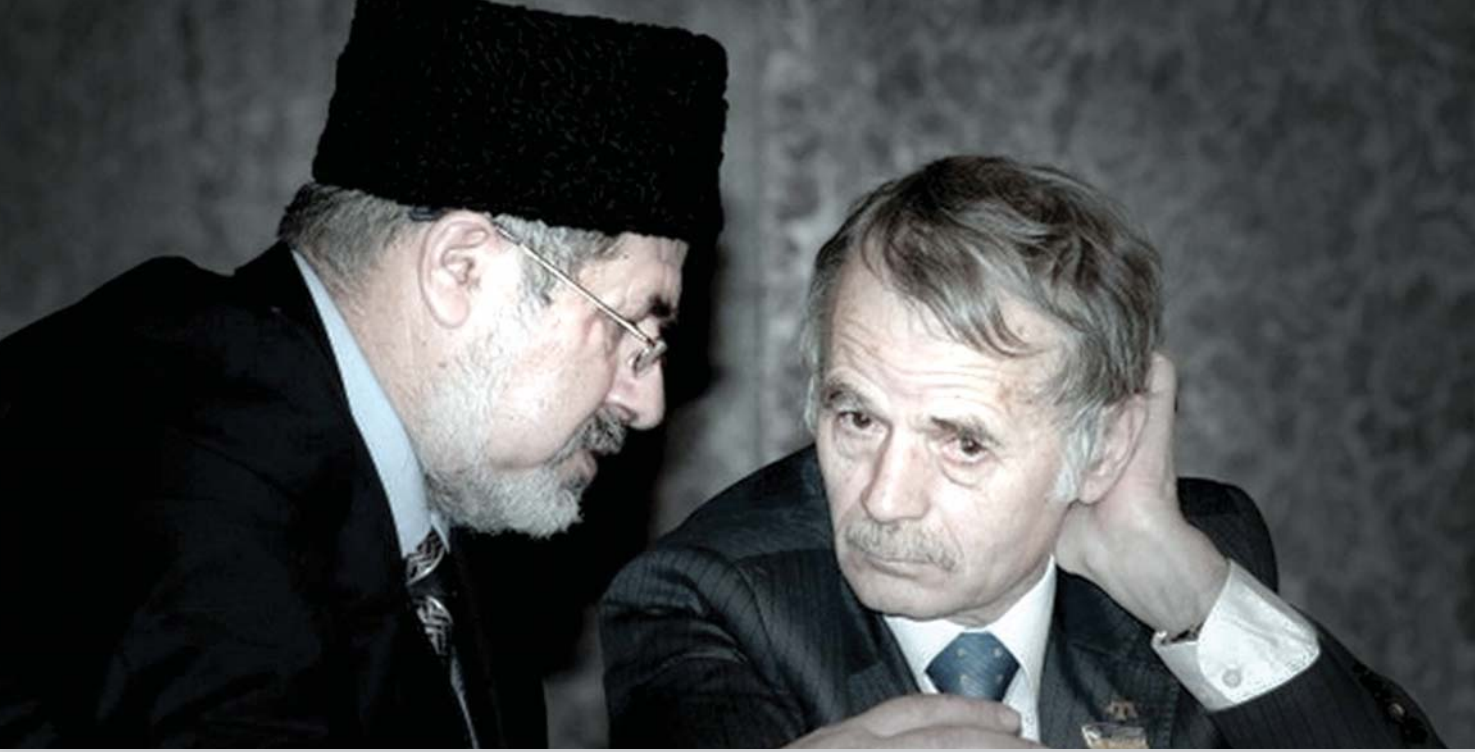
Refat Çubar ve Mustafa Cemilev (Kırımoğlu)

nında, Ukrayna Cumhurbaşkanlığı İdaresi'ne bağlı, bu platformu koordine etmeye yönelik bir mekanizma oluşturulması da üzerinde çalışılan düşünceler arasında yer almaktadır. 31 Oluşan bu kapsamlı yapının esnek karakterini sürdürmesine bu aşamada önem verilmektedir. Farklı mekanizmalarla desteklenecek olan ve yakın zamanda sekreteryaasının oluşturulması beklenen bu platformun hâlihazırda çalışan bölgesel ve küresel uluslararası kuruluşları taklit etmesinin doğru olmayacağı düşünülmektedir. 32