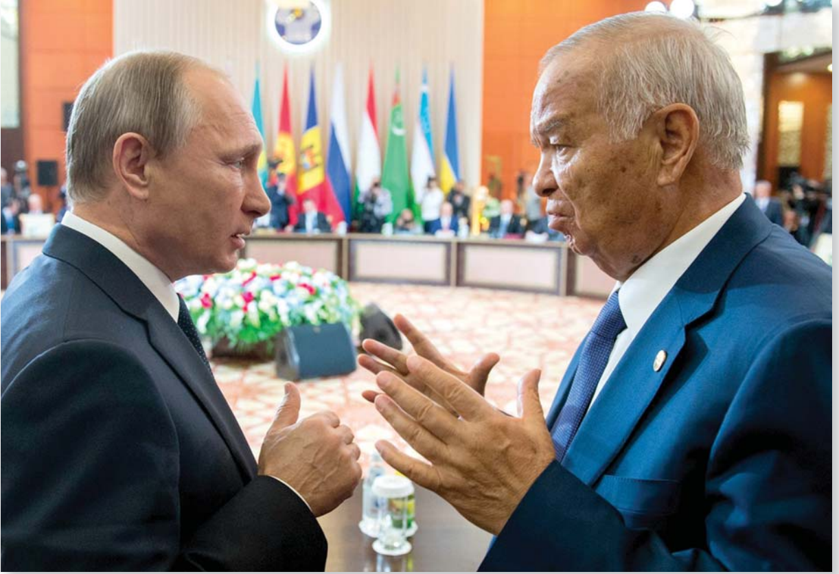
Özbekistan Cumhurbaşkanı Kerimov, Rusya Federasyonu (RF) Devlet Başkanı Putin'le

ortamlarına girmeyerek, kendilerini 'Müslüman olarak tanımlama' sürecine imkânlar dâhilinde barış içinde devam etmişlerdir.