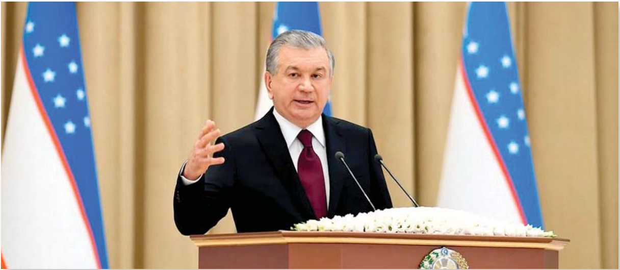
“Kerimov sonrası reformlara hız veren Özbekistan Cumhurbaşkanı Şevket Mirziyoyev”

Tüm bunlar ışığında ortaya çıkan husus, demokratik gelişim ve geniş toplumsal istişare süreçlerinin önemidir. Özbekistan örneği göstermektedir ki, köktenci dini yönelimler, halkın kendini ifade edecek muhalefet kanalları açılmazsa ve sosyo-ekonomik koşullar iyileştirilmezse tekrar su yüzüne çıkabilir. Bu tarz yönelimlerle sadece güç ile baş edilebileceğini ummak bir hayalden öteye gidememektedir. Böyle bir durumda, hem mevcut yönetimler hem de halkın kendisi kaybeden taraflar olmaya devam edecektir.