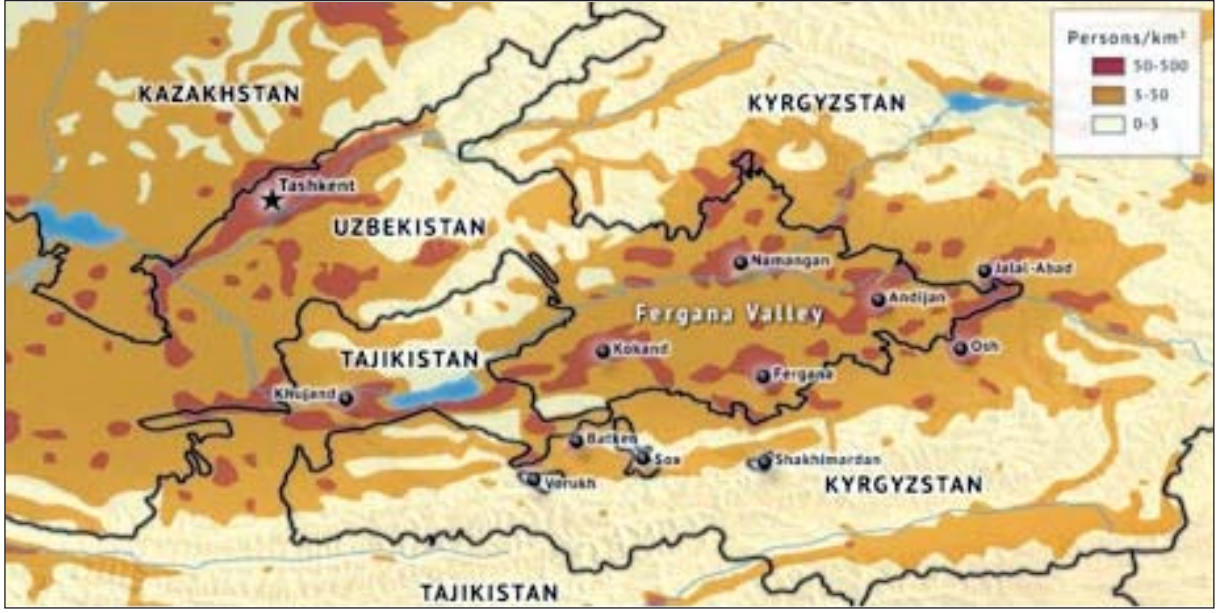
“Fergana Vadisi.”

Birçok bölge uzmanına göre “Orta Asya’nın merkezi” olarak kabul edilebilecek Fergana Vadisi’ndeki “karışık dil ve millî kimlik ilişkisi” 20. yüzyılın başlarına geldiğinde en güzel şu şekilde ifade ediliyordu: “Bu çok dilli vadinin köylerinde [insanlar] evde Özbekçe, camide Tacikçe ve eşinin ailesiyle Kırgızca konuşmaktayken, dil temelinde kendi kimliklerini seçmelerinin gereğini anlamıyorlardı. Bunların hangi birini seçeceklerdi? Fergana Vadisi’nin köylüsü için hepsi eşit derecede önemliydi.” 23