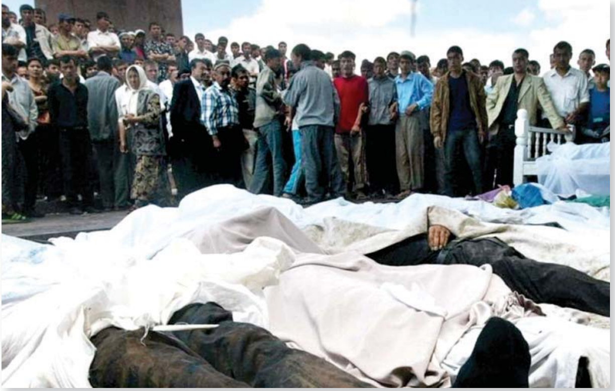
“Andican’da yaşanan kayıplar”.

olarak, Özbekistan’da örgütlü bir muhalefet yapısına sahip olmayan, demokratik seçimlerin yapılması ve iktidara bu yolla gelmesi gibi bir iddia içinde bulunmayan Fergana’daki ayaklanmacıların, bu çerçevede başta Batıdan ve Dünya ülkelerinden destek almalarının kolay olmadığı da bilinen bir gerçektir.